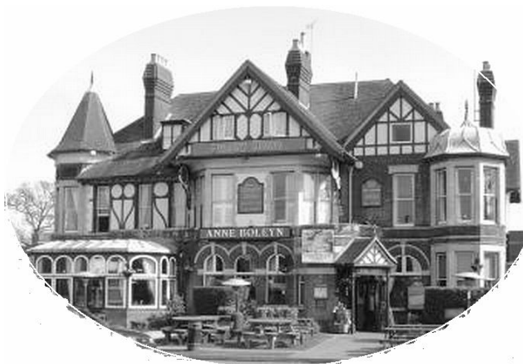
"Anne Boleyn", Rochford