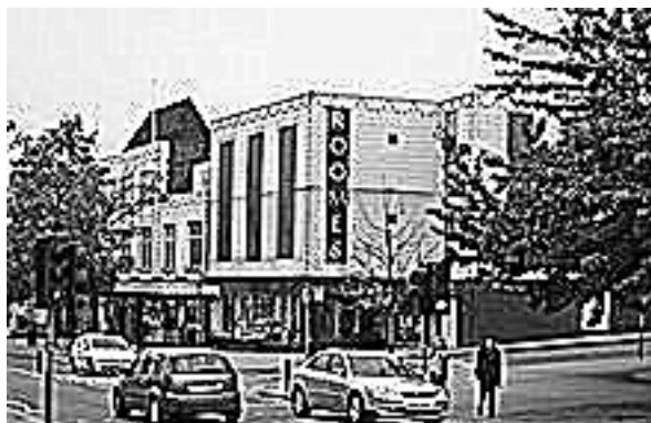
Roomes (Home & Fashion) Store, Station Road, Upminster

* = Destination to be decided on the day