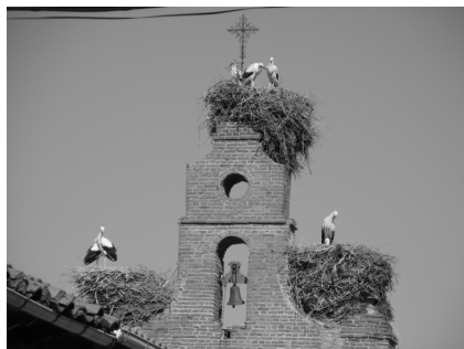
Amazing stork nests in Villanueva

On Thursday morning, our breakfast was fairly basic and when we set off at 8.30 it was seriously cold, on the first downhill we were perished. We stopped at a market to buy fruit from a fabulous array before rolling on to Villanueva where we stopped to look at the amazing stork nests on the church and did our good deed for the day by helping an old lady who was struggling home with a huge bundle of firewood. Down the Orbigo valley, we saw what looked like hops growing, a bit