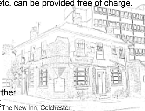
The New Inn, Colchester

Check our website for further information: www.colchesterctc.co.uk