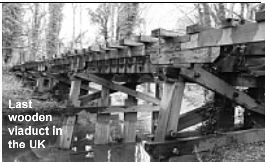
Last wooden viaduct in the UK

For safety's sake I had taken with me from my cycle bag a small plastic bag containing my wallet. In order to take a few photos I temporarily placed this