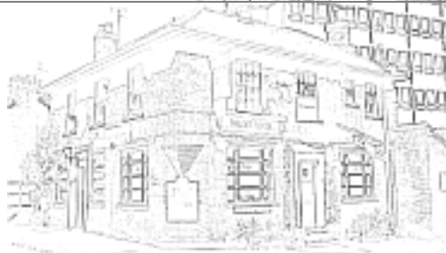
The New Inn, Colchester

Check our website for further information: www.colchesterctc.co.uk