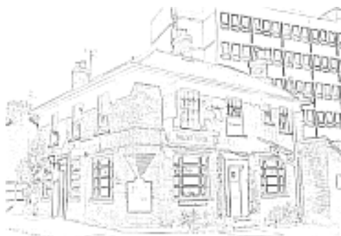
The New Inn, Colchester

Check our website for further information: www.colchesterctc.co.uk