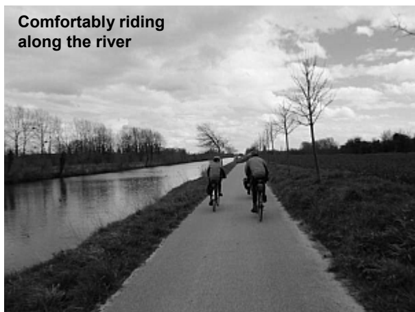
Comfortably riding along the river

In St. Valerie, we locked-up our bikes near the tourist office and went wandering in search of food. The town was very busy with French people going to a nice seaside town on a Sunday. We attempted to get into several restaurants for lunch, but everywhere was full-up and we were turned away. After much searching, three of us found a place at the far edge of town that served gallettes (savoury pancakes) and crepes. Initially we had to sit outside in the cold and drink our beer, but the restaurant slowly emptied and so we were allowed inside to eat. Outside was a market being dismantled after the morning's trading. I was pleased that we took the trouble to find somewhere that served proper French food, rather than have take-away sandwiches or burgers.