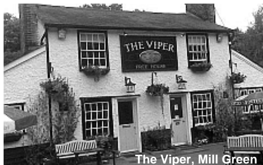
The Viper, Mill Green