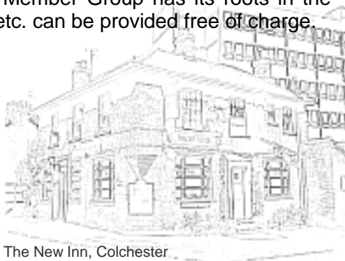
The New Inn, Colchester

Members are welcome to attend Bike Drinks, for all local cyclists, held on the 3 rd Monday of the month, 8pm at “The New Inn”, Chappel St South (CO2 7AX).