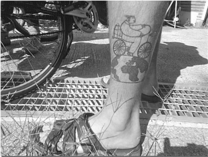
"Round the world cyclist noted in Kyushu, Japan"