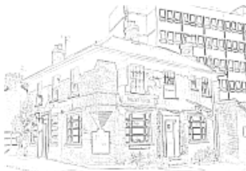
The New Inn, Colchester

Members are welcome to attend Bike Drinks, for all local cyclists, held on the 3 rd Monday of the month, 8pm at “The New Inn”, Chappel St South (CO2 7AX).