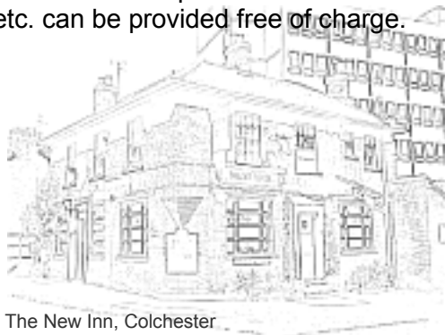
The New Inn, Colchester

Members are welcome to attend Bike Drinks, for all local cyclists, held on the 3 rd Monday of the month, 8pm at “The New Inn”, Chappel St South (CO2 7AX).