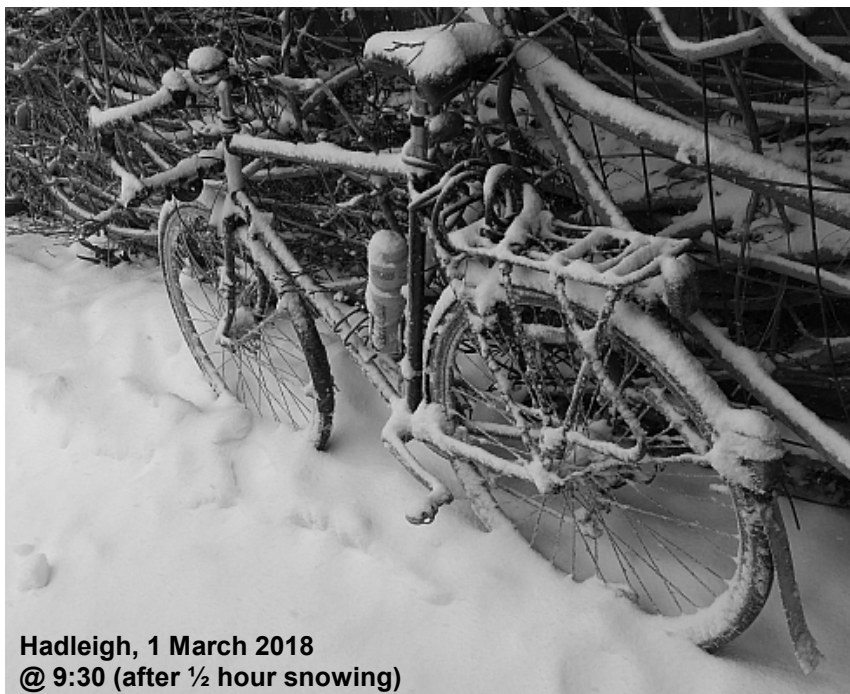
Hadleigh, 1 March 2018 @ 9:30 (after ½ hour snowing)